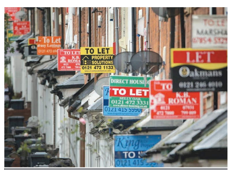
The view after Brexit in the UK.

foreigners/expats), renters will be spoiled for choice, even more, as the number of vacant leased homes/ properties increase, causing landlords to drop rates. Then again, depending on which "side of the fence you're on", there will be losers and gainers unless one has had the foresight and considered a longterm investment plan beforehand.