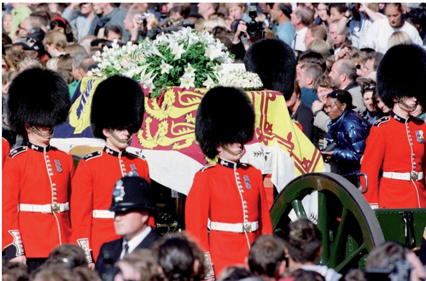
(left) Diana's royal ceremonial funeral on Sept 6, 1997, watched by over two billion people worldwide.

Yet Biteback and Cole withdrew the book just two weeks before its scheduled publication, citing "an abrupt change of mind" by Mohamed, and leaving another void for conspiracy theorists to fill. - dpa