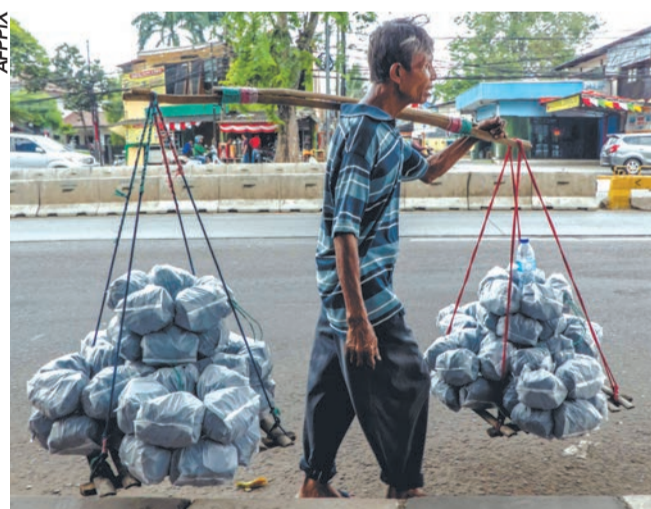
Globalisation and technological revolution have created a chasm between 1% of the super class and 99% of the rest.

In Europe, whose lower social orders had never had it as good as the American colonists, the industrial revolution was so socially wrenching that it inspired the first coherent political