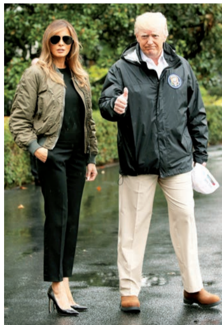
Trump and Melania depart the White House to visit Texas on Tuesday.

She stepped off Air Force One wearing black trousers and a white button up shirt, trading the stilettos for white tennis shoes.