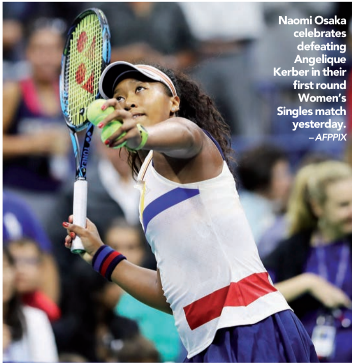
Naomi Osaka celebrates defeating Angelique Kerber in their first round Women's Singles match yesterday.

concentrate, which I needed as Angelique gets everything back."