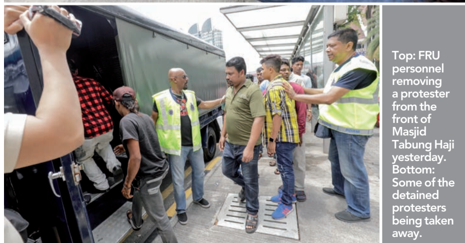
Top: FRU personnel removing a protester from the front of Masjid Tabung Haji yesterday. Bottom: Some of the detained protesters being taken away.