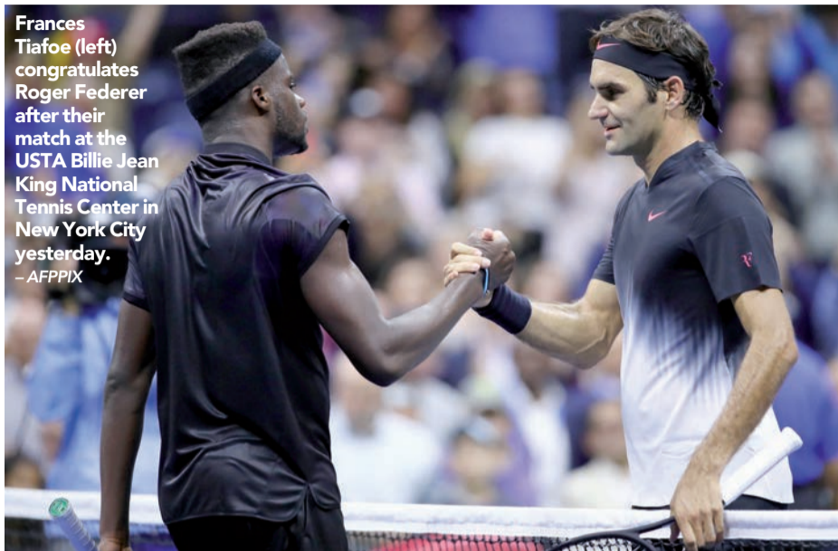
Frances Tiafoe (left) congratulates Roger Federer after their match at the USTA Billie Jean King National Tennis Center in New York City yesterday.

The back problem, which Federer suffered in losing the Montreal final to Alexander Zverev and ruled him out of the Cincinnati tournament, restricted his movement in the