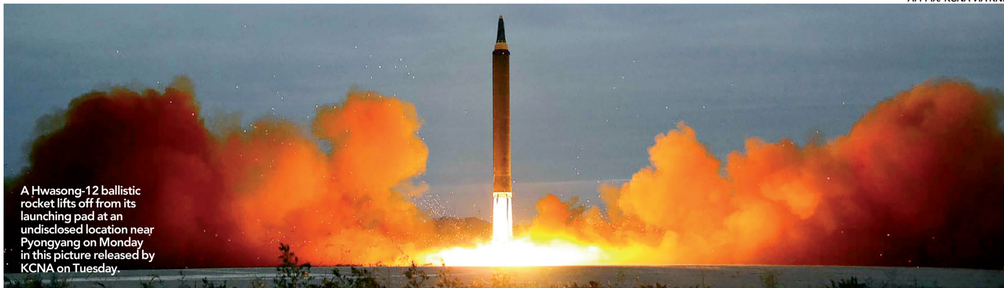
A Hwasong-12 ballistic rocket lifts off from its launching pad at an undisclosed location near Pyongyang on Monday in this picture released by KCNA on Tuesday.