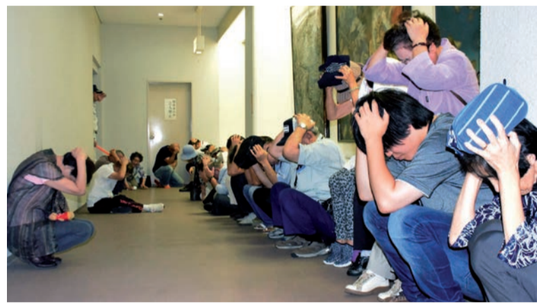
Residents in the Japanese city of Wajima cover their heads during an evacuation drill for North Korean missiles yesterday.

Diplomats say veto-wielding council members China and Russia typically only view a test of a long-range missile or a nuclear weapon as a trigger for further possible sanctions. - Reuters