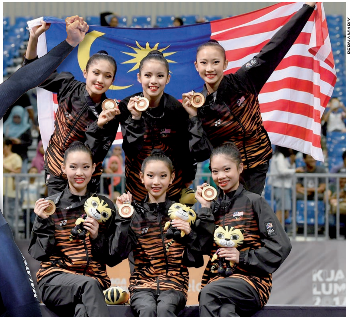
National gymnasts show off the gold medals in team rhythmic gymnastics at the Malaysia International Trade and Exhibition Centre yesterday.

Sultan Mizan, who is the first sultan to participate in the SEA Games, credited team effort for Malaysia's success. He is ranked fourth in the world in this discipline.