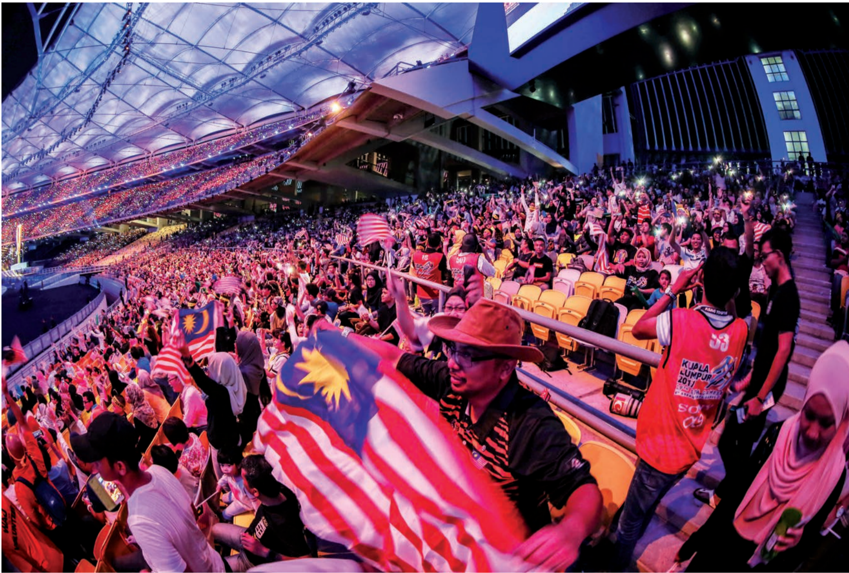
The near-capacity crowd at the National Stadium in Bukit Jalil last night enjoyed song and dance performances and a fireworks display.