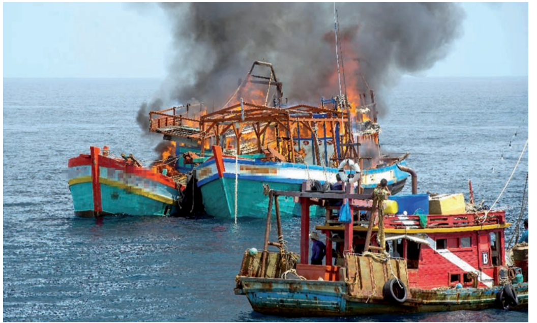
The boat in flames off Kelantan yesterday.

"He let his guard down and wasn't fully aware of what had happened."